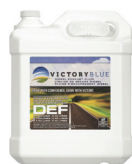
2.5 Gallon Part# VB2003-VB