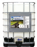
330 Gallon Tote Part# VB2009-VB